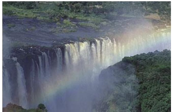
Victoria Falls is one of the Seven Wonders of the World

Add-ons: it is easy to add a visit to Victoria Falls to this itinerary. Doing so will add three more days to your Safari.