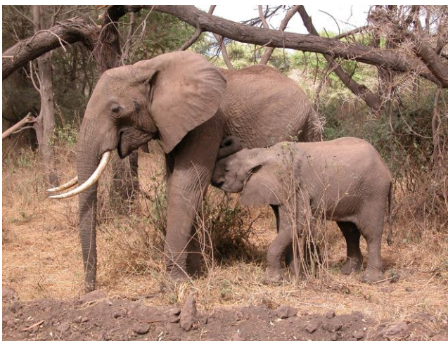
The only bush animal with its mammary glands in the front