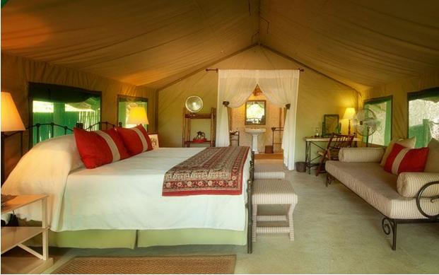
One of 12 Tanda Tula Tented Camp Accommodations