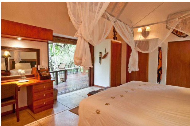
One of only Five Monwana Suites

Monwana (BBLD) Access is from Hoedspruit